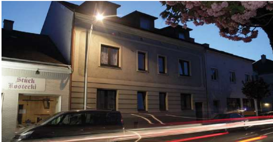
Fig. 2: The house of Josef Fritzl