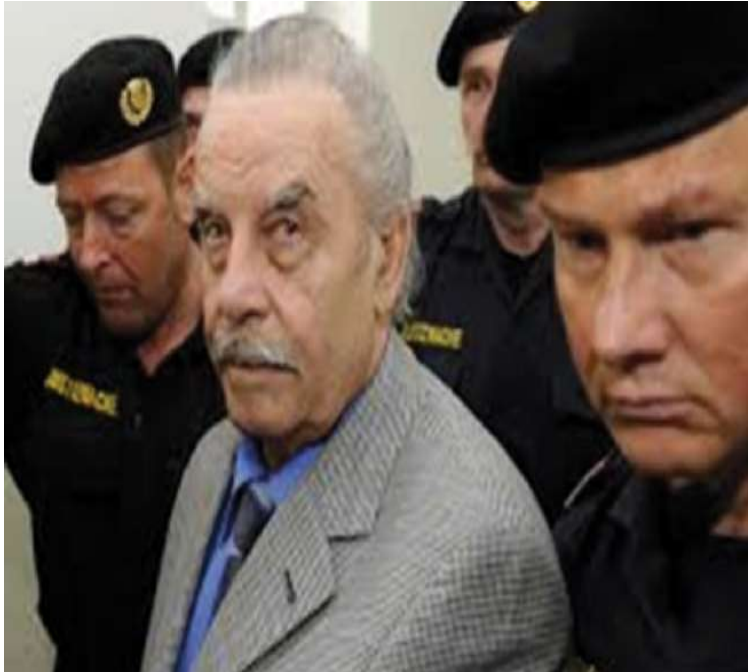
Fig5 : Josef Fritzl

Josef showed up at the court covering his face for the first two days. He claimed to be not guilty. As the case went on, he was charged with murder and rape. Ultimately, Josef suddenly changed his claims and admitted to his guilt.